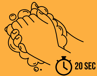
Wash for 20 Seconds