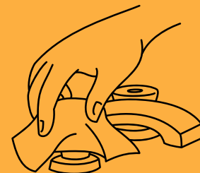
Turn Off Tap with Towel